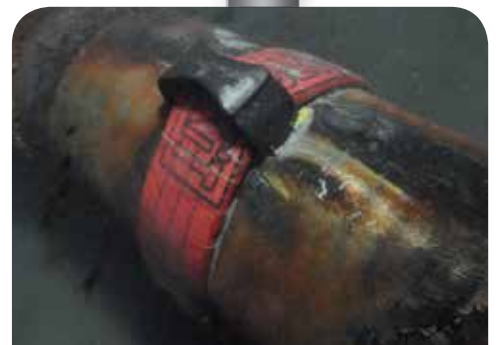
OFFSHORE - SUBSEA